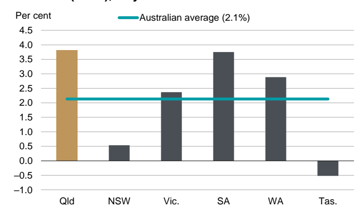
Figure 2 Monthly change in total dwelling units approved (trend)